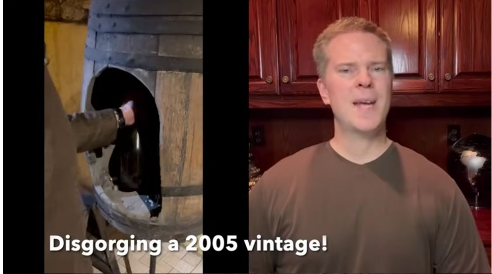
Disgorging a 2005 vintage!