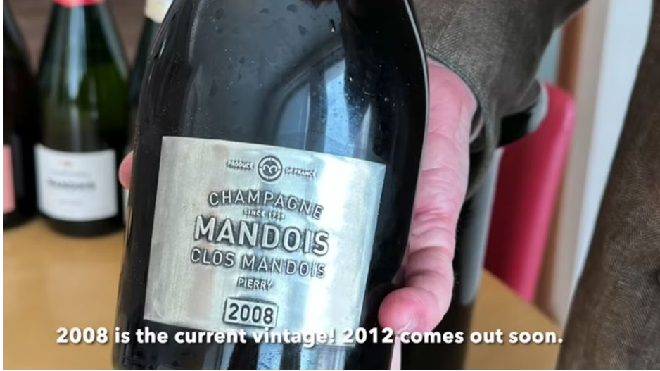
2008 is the current vintage! 2012 comes out soon.