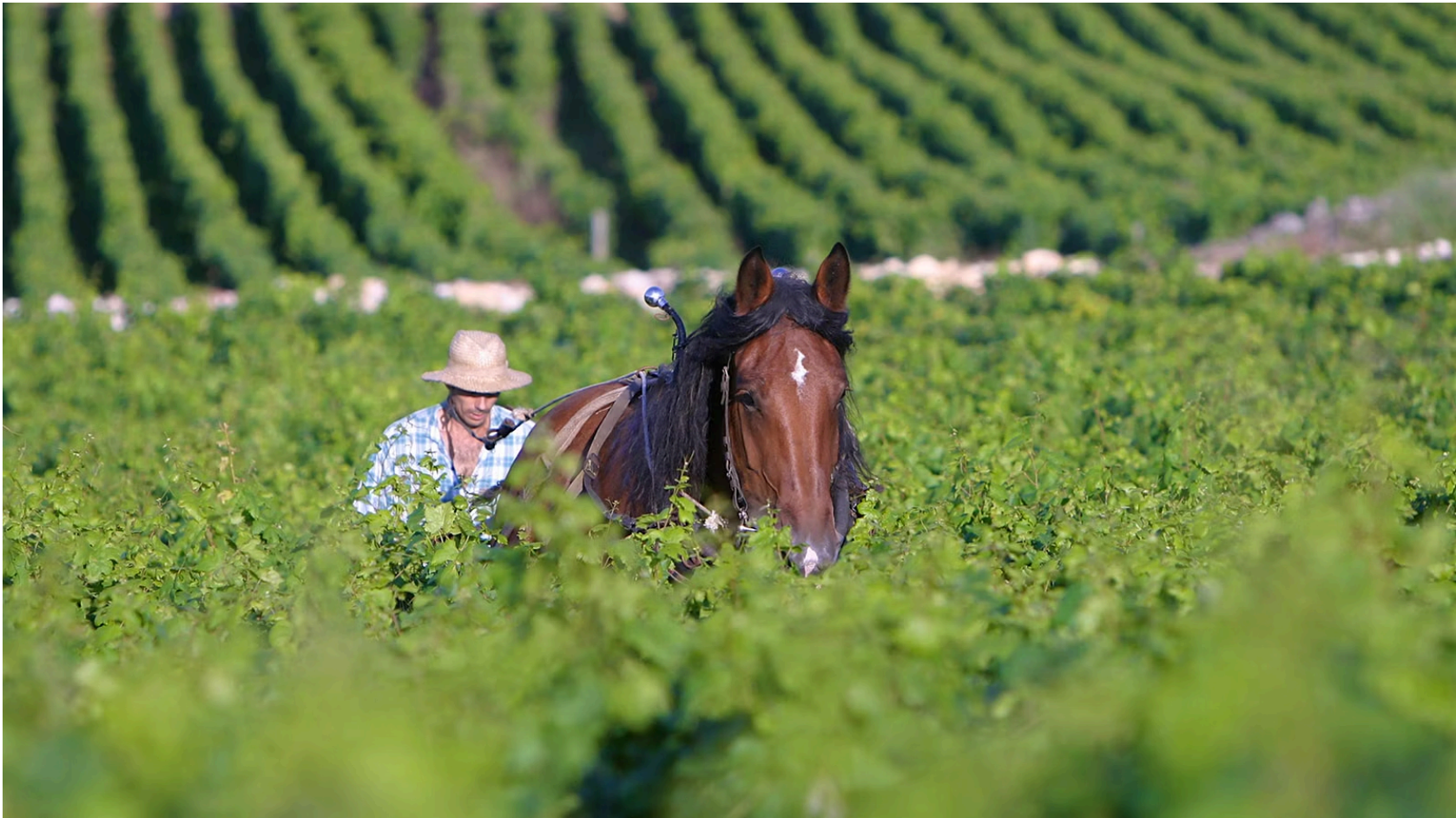
Leading domaine Joseph Drouhin harvests grapes from estate vineyards up and down Burgundy, from Chablis to the Mâconnais.

Explore the leading French wine region with new reviews of impressive Chardonnays from Chablis and the Mâconnais, up to 92 points